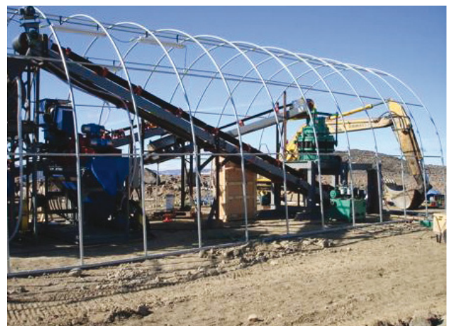
The DMS plant at Garnet lake installed (Photo:Hudson).

The Seqi olivine mine, situated 90 km from Nuuk, is based on a very large homogenous deposit of high quality olivine, with reserves at least 100 million tonnes of olivine ore. It is operated by Minelco A/S after the opening in 2005. The company supplies minerals and mineral products to the steel industry. Olivine is used extensively as a refractory raw material, as a slag conditioner in blast furnaces and as a tap hole filler in electric arc furnaces.