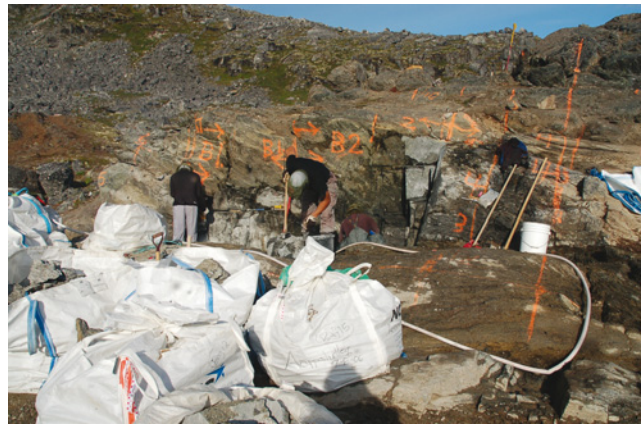
Sampling for rubies at one of the targets in the Fiskensæset area

6 November 2007 the company released information on the opening of an office in Bangkok, Thailand. The new office facility will be used to sort and grade rough gems from the Fiskensæset Ruby Project. The new office facility is located in one of the major centres for the international