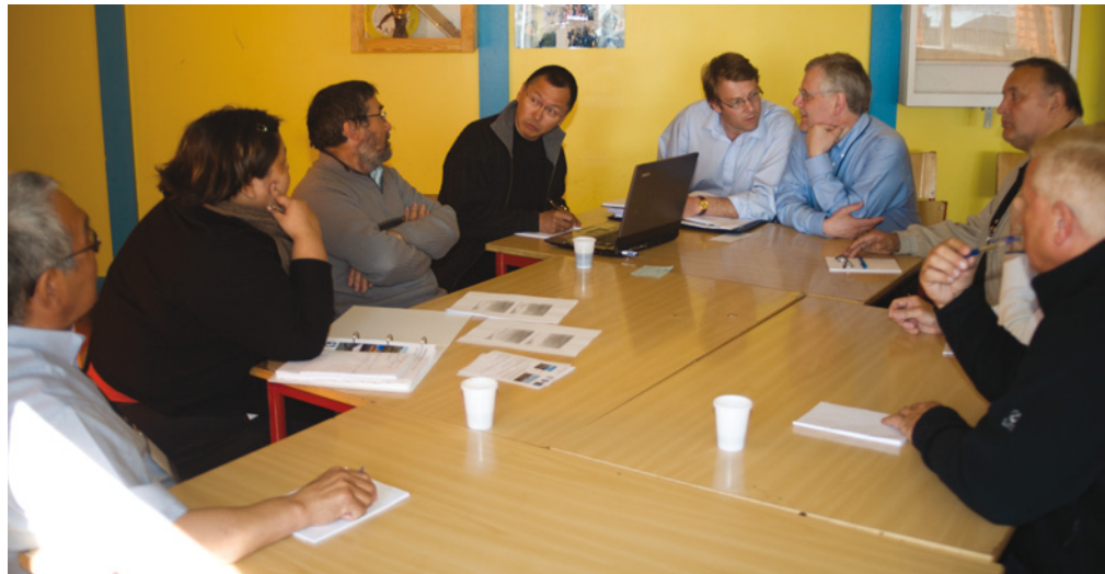
Industry, municipal and government representatives discuss various aspects of the possible reopening of the Black Angel in a subgroup at the 2007 follow-up meeting in Uummannaq.

The BMP tradition to exhibit at the yearly Roundup trade show in Vancouver, Canada, will continue in 2008. You are invited to visit the Greenland booth (C11/ C12), on January 28 to January 31 2008. The exhibition and material will focus on mining and exploration, especially, gold, base metals and minerals from the magmatic environment. Stop by and meet the experts, who will be ready to tell you about geology, licensing and logistics in Greenland.