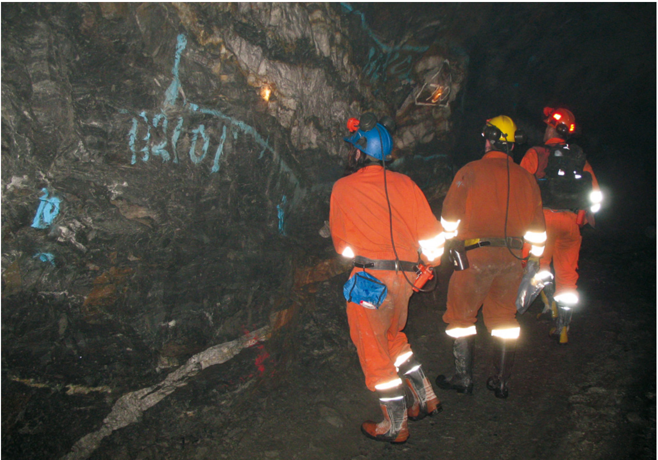
Underground inspection at the Nalunaq gold mine.

able Feasibility Study pertaining to early pillar extraction from the old Black Angel mine itself.