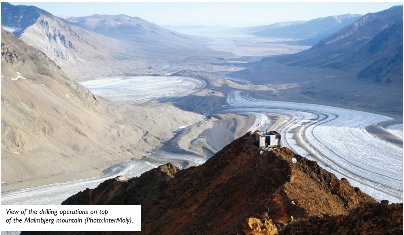
View of the drilling operations on top of the Malmbjerg mountain.

The thirty one holes completed this year, comprising 7353 metres of diamond drilling, should increase resources considerably. The Company's consultants Wardell Armstrong International are presently preparing an up to date Resource Statement for the Glacier zone as well as a Bank-