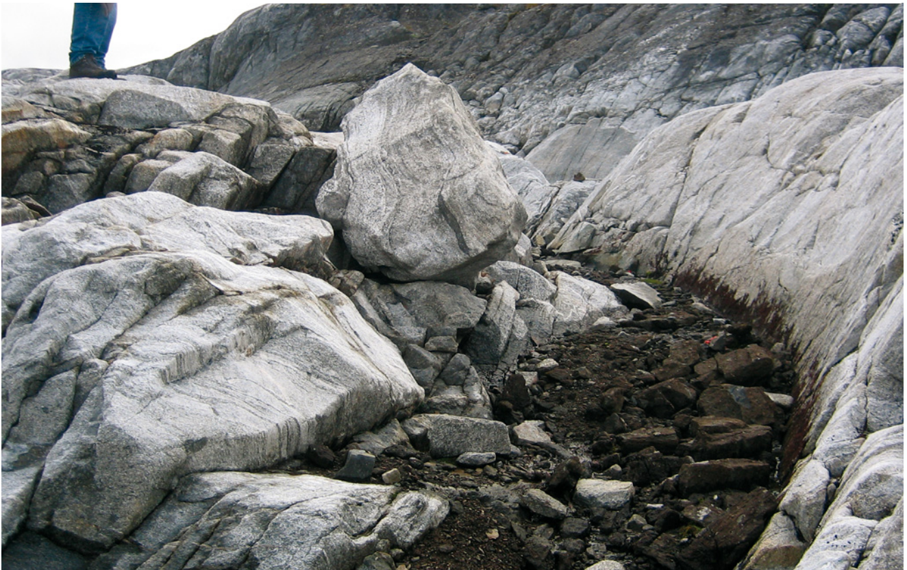
A typical kimberlite outcrop in the Maniitsoq area.

to follow up on the sensational find of a 2.4 ct. diamond from the site, also reported in Minex 30 (February 2007).