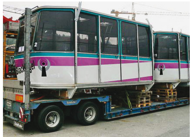
The new cable car ready for shipping to Maarmorilik.

Angus & Ross plc has in a press release dated 17 October 2007 provided the latest drilling update from one of the new discoveries near the old mine, the Glacier discovery, demonstrating the best grade so far with more high grade zinc/lead intersections including 2.13 metres @ 20.1% zinc and 10.2% lead. The Glacier zone is the third largest body of mineralisation ever found at the Black Angel property, after the Angel and Cover zones. It is now known to extend 650 metres along its east-west strike, and this year's drilling has extended the zone of mineralisation roughly 150 metres to the west where it remains open.