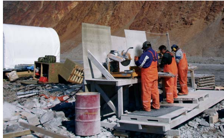
Setup for core cutting in the Malmbjerg basecamp, 2005.

“We believe that this new area significantly increases the likeli-