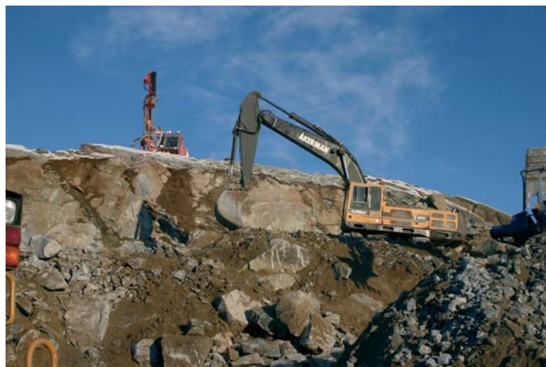
Open pit mining and drilling at the Seqi olivine deposit, November 2005.

In an agreement with Crew Gold Corporation, Minelco has purchased all shares in the Greenlandic operating company Seqi Olivine A/S, which will begin the mining operations and place the olivine deposit into production.