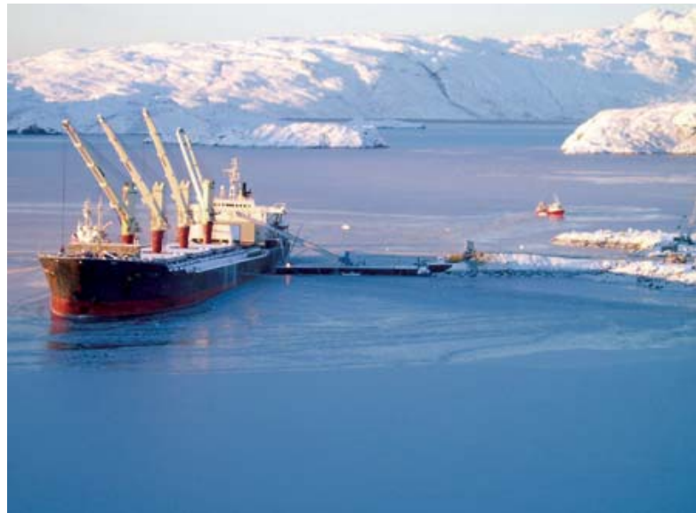
The first vessel with olivine sailed from Greenland on 2 December, bound for Amsterdam. The "Arctic Trader" arrived in Greenland on 22 November, completed loading on 2 December when she sailed for Amsterdam with approximately 46,000 tonnes of first-class olivine.

40 participants representing international university and survey research teams, collaborators and diamond exploring companies attended the workshop. Data from recent investigations and exploration for diamonds in West Greenland and other Archaean cratonic regions in the Northern Hemisphere, especially those in glaciated terrain, were in focus.