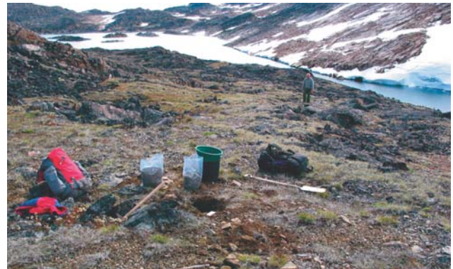
Collecting of till samples near the Sarfartoq licence

2004). In 2004 exploration efforts are again focusing on diamonds and gold, however, commodities like nickel, platinum-group metals, niobium-tantalum, coloured gemstones and selected industrial minerals are also being considered.