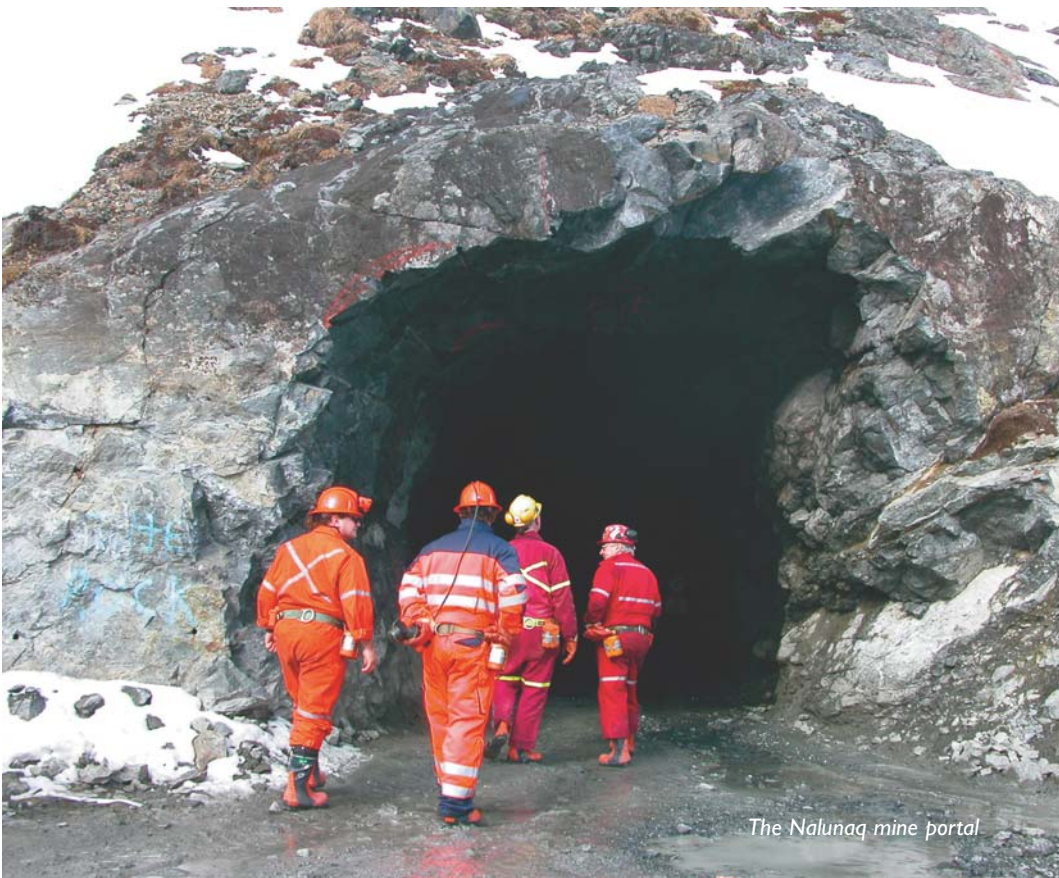
The Nalunaq mine portal