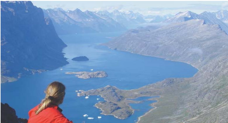
The Crew exploration area in the vicinity of the Nalunaq mine