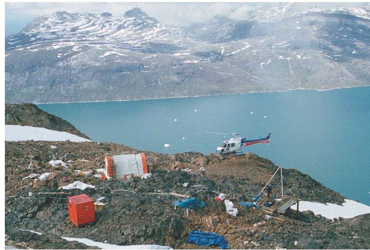
Drill camp and heli-path at the NunaMinerals Storø project

A new license, the Akuliaruseq license area, acquired by Crew in 2004, is particularly promising in view of its location along one of the largest crustal shear-zones recognised in South Greenland, the Saarloq Shear Zone. Last year, a sample with a high gold content was collected from this area and awarded first prize in the national 'mineral hunt' competition - the 'Ujarassiorit'.