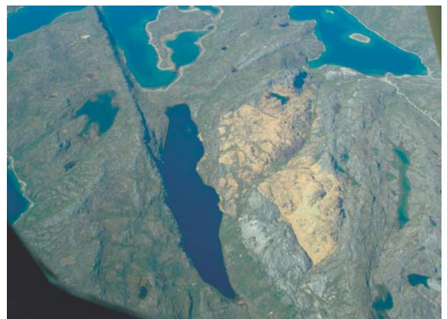
Aerial view of the Seqi olivine ore body

As already reported in MINEX 25, this project is progressing fast. The deposit is a large, homogeneous resource of the industrial mineral olivine, and is being investigated by Seqi Olivine AS , which is owned by Crew Gold Corp. In partnership with Minelco AB , a subsidiary of Swedish iron producer LKAB , Crew is currently completing detailed engineering, following a positive feasibility study, and are planning to apply for an exploitation permit for the start of production in 2005.