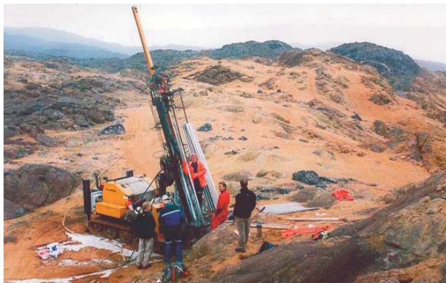
Drilling at the Seqi olivine deposit

Seqi Olivine AS now states that the project is feasible with little technical risk; the olivine quality is suitable for the purpose. The planned quarry design, comprising only the western half of the deposit, has a life in excess of 20 years at the specified production rate. The project is initially assuming an operating season of April to November to produce the specified 1.1 million tonnes. Extraction of the olivine will be in open pit with 15-m benches using conventional drilling and blasting. The crushing equipment allows for the initial production of almost any grade of olivine. In this context, the material quality is usually the same, only the size fraction differs. A detailed topographic survey has been conducted and 1150 assays have been carried out on samples from 22 holes drilled in 2003. The assays have shown that the area hosts very high olivine quality. Current resources of 84.3 mill tonnes at 48.1 % MgO and 0.56% LOI have been identified.