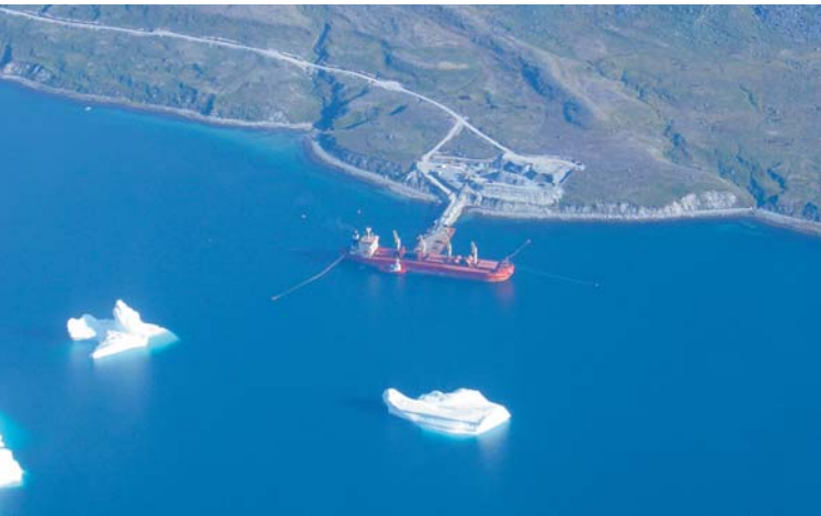
Port facilities at Nalunaq

90 diamond drill holes have been drilled from 35 pads (drill-sites), totalling approximately 14,230 metres of core. Moreover, drilling does not allow definition of resources, only structure, because of the high nugget effect. Systematic sampling in underground drifts is required to define bankable resources.