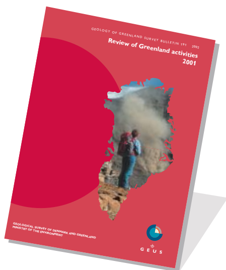
Geology of Greenland Survey Bulletin 191, 2002: Review of Greenland activities 2001, 161 pages.

The annual Review of Greenland activities is a special bulletin. It contains articles on activities carried out in 2001 written in a style that enables other than professionals to get an all-round impression of recent georesearch.