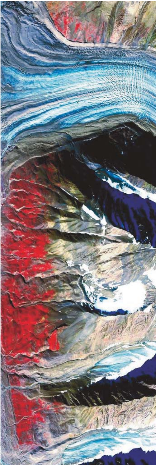
False colour 'quicklook' of HyMap TM data west of Mestersvig, July 2000. Grey and brown colours are sediments, bright red colours are vegetation and ice-blue colours are glaciers. Size of field: 10 x 2.3 km.

continental rift environments. In several of other mafic intrusions along the East Greenland volcanic rifted margin sub-economic PGE mineralisations have been recorded.