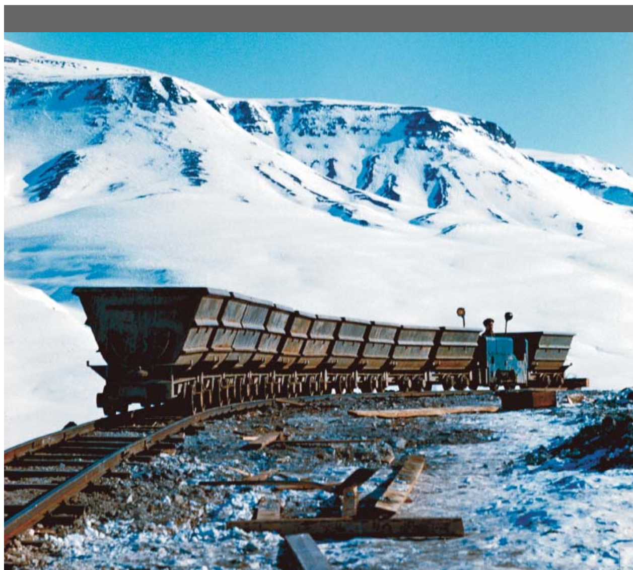
Handling of ore and waste in high arctic Greenland, Mestersvig, East Greenland, 1956.

Moving from north to south in East Greenland known major prospects are the Citronen Fjord (zinc-lead) in Palaeozoic North Greenland; Ymer Island (gold, antimony, tungsten) in Caledonian North-East Greenland; the former mine near Mestersvig (lead, zinc) in Palaeozoic-Mesozoic East Greenland;