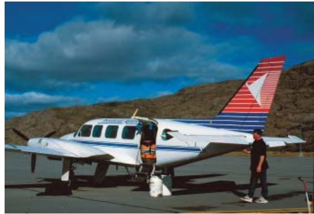
The aircraft used for the hyperspectral survey 2002 in Kangerlussuaq airport, West Greenland.