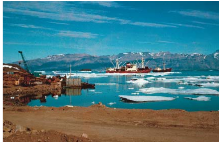
Shipping of ore concentrate from the Mestersvig harbour (Nyhavn) in 1956.

The East Greenland volcanic rifted margin developed during the opening of the North Atlantic under the influence of the ancestral Icelandic mantle plume. The magmatic activity is recorded from 61 to 13 Ma. The more than 6 km thick flood basalts of the Blossville Coast formed mainly during the early stages of the magmatism