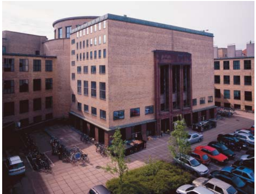
'Geocenter Copenhagen', new premises for GEUS from May 2002.

In May and June 2002 GEUS moved from the premises at Thoravej to the newly established 'Geocenter Copenhagen',