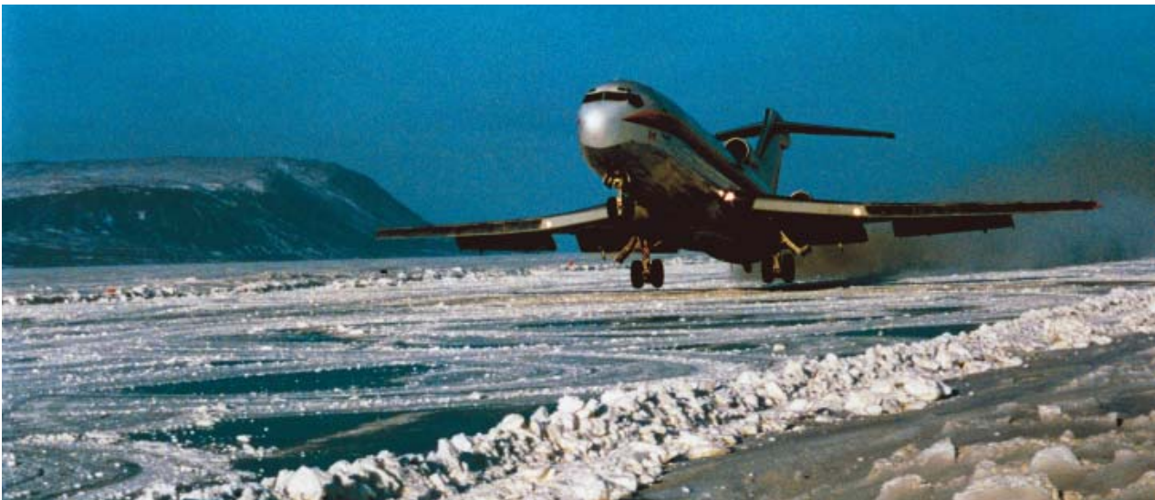
In winter the ice-covered fjords serve as field airstrips, Citronen Fjord, North Greenland, 1995.

Greenland is actively encouraging mineral activities in North and East Greenland. A favourable three-year exploration licence, with reduced exploration commitments, is available for areas of over 1,000 km 2 in North and East Greenland. The total annual exploration commitment for this special exploration licence is DKK 617 (USD 80) per km 2 . The licence is exclusive and the licence period is 3 years. In the licence period the licensee is entitled to be granted an exploration licence on regular terms. It is normally granted for five years and may be