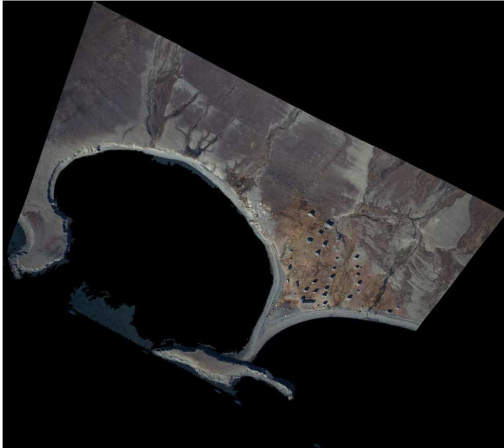
Figure 3. Example of one of the individual processed orthophoto, with the abandoned town of Moriusaq (see Fig. 2 and 4) in the right part of the photo, taken from the B212 helicopter at an altitude of 1000 m.