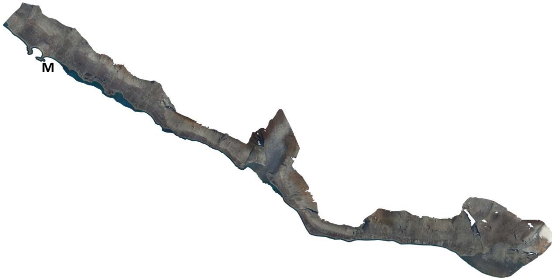
Figure 4. Resulting mosaic of the individual processed and stitched orthophotos from Morisuaq (marked with an M).

The orthophoto was also produced using Agisoft Photoscan and delivered as an 1 m orthophoto.