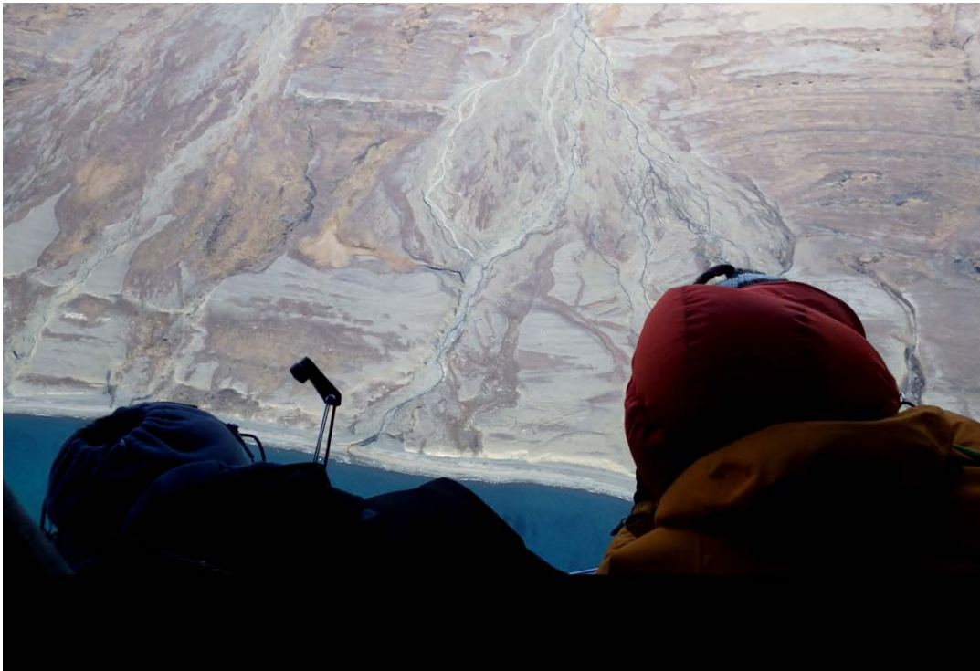
Figure 1. Acquisition of oblique stereo-images using two handheld cameras by taken photos out of the open Air Greenland B212 helicopter door at 1000 m altitude.

The images were acquired from a B212 helicopter (sliding-door detached) using handheld cameras that were pointed downwards during data acquisition (Fig. 1). Orthophotos from the entire coast from west of Moriusaq to Salisbury Gletscher was acquired and processed (Fig. 2).