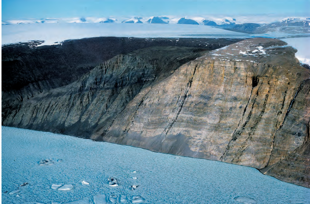
The Navarana Fjord escarpment marks shelf and trough facies shift in the Franklinian Basin. This facies border is believed to be one of the guiding controls on the formation of zinc mineralisations in North Greenland. Several zinc occurrences and stream-sediment zinc anomalies are associated with the structure.

Citronen deposit is expected to be 101.7 Mt at 4.7% Zn+Pb at a 2% Zn cut-off (Jan. 2011). The mineralisation is hosted in three levels within a 200 m thick sequence of Ordovician black shales and chert. The mineralisation is considered to be of a SEDEX-style zinc type. Also the shallow-water platform, shelf and slope facies of the Franklinian Basin are known to host several mainly carbonate-hosted zinc occurrences of the Mississippi Valley-type, e.g. the Petermann Prospect, the Cass Prospect and the Navarana Fjord occurrences; none of these have been investigated in detail. The facies-border and structures that most likely have a guiding control on the mineralising systems within the basin in North Greenland can be observed for several hundred kilometres and may represent an excellent target for Zn-Pb exploration.