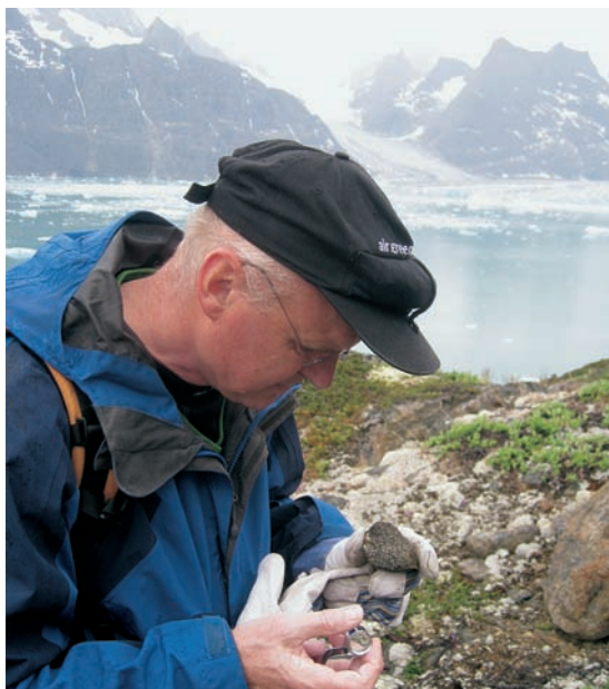
The BMP geologist studying a sample from an award locality.

Only non-geologist residents of Greenland can participate in the Mineral Hunt. The rock samples have to be found in Greenland and only samples with information on exact location can be awarded a prize. The samples