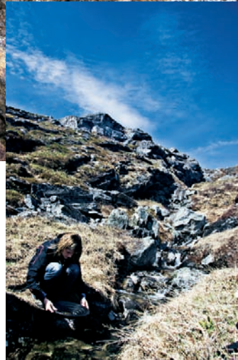
Field check near award localities.