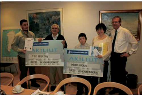
Awards presented to the winners at the BMP office in Nuuk.

for further analysis. Approximately 20 percent of the samples are analysed in detail.