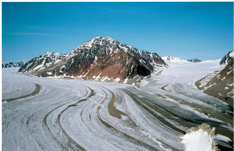
Malmbjerg, seen from the south, between Schuchert Gletscher (left) and Arcturus Gletscher (right).

Molybdenite mineralisation occurs in a 700 x 700 x 150 m inverted bowl-shaped body mainly located in the perthite granite and its porphyritic roof phase. Molybdenite occurs in veinlets ranging in thickness from hair-line up to about 5 cm. The veinlets form a stock-work of mutually offsetting veins. Pyrite occurs only as an accessory mineral with an overall content of less than one per cent. Furthermore, Mo-W-bearing greisen mineralisation occurs as flat-lying up to one metre thick