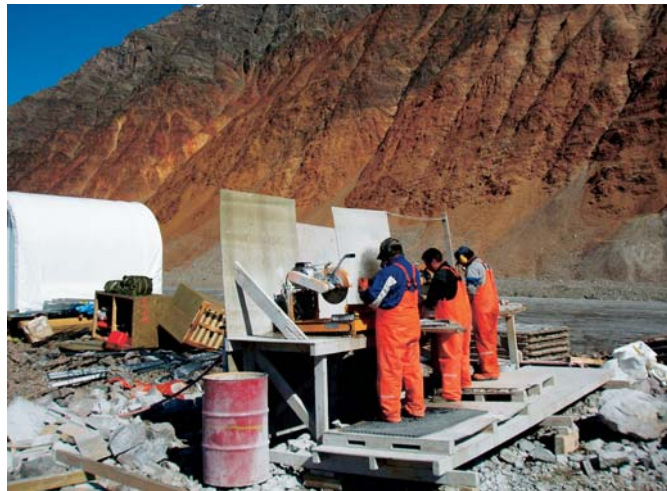
Splitting drill cores in InterMoly's camp, 2005

The projected capital costs for the 15,000 t/d Malmbjerg project are estimated to be in the order