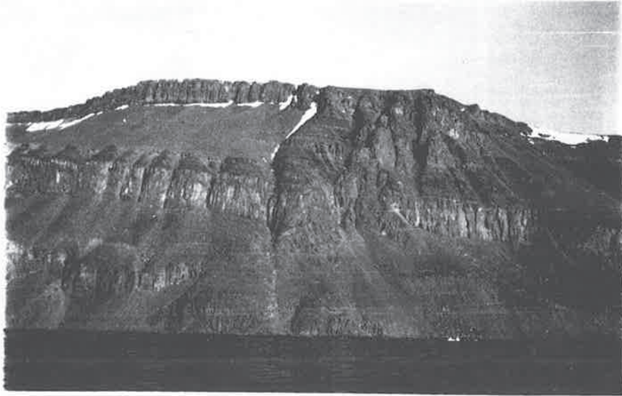
Fig. 3. Coastal cliffs south of Kap Peary, Granville Bugt, showing three main basic sills and a younger dyke cutting shales of the Dundas Formation. Both sills and dykes are titanium rich. The cliffs are about 500 m high. 6th September, 1974.