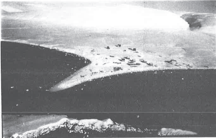
Fig. 5. View over Moriussaq across the coastal plain to the bedrock scarp. The beaches of the coastal spit are composed of black ilmenite sands (see Fig. 7). New snow fall, 14th September, 1975.