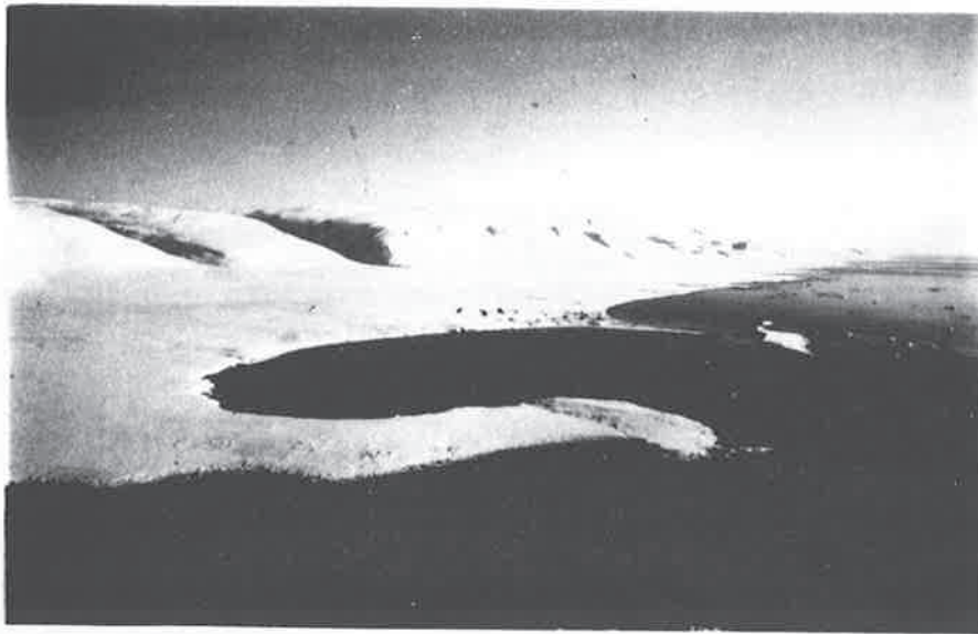
Fig. 4. View to the south-east along southern Steensby Land illustrating the uplifted coastal plain that is about 1 km. wide. New snow fall, 14th September, 1975.