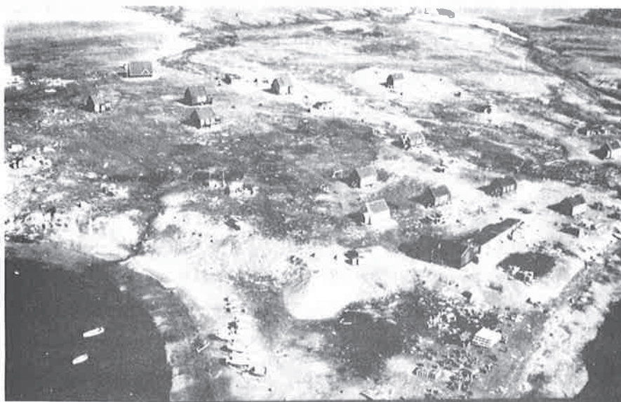
Fig. 7. Aerial views of Moriussaq illustrating the black colouration of the active beach sands.

Upper : two areas of well-preserved raised beaches are separated by a wide braided water-course. Such streams have redistributed the littoral deposits and the heavy mineral concentrations. 4th August, 1978.