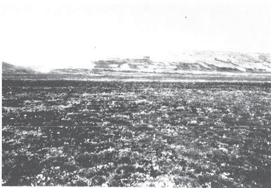
Fig. 6. Surface of the raised beaches behind Moriussaq showing low, grassy vegetation. 5th August, 1977.