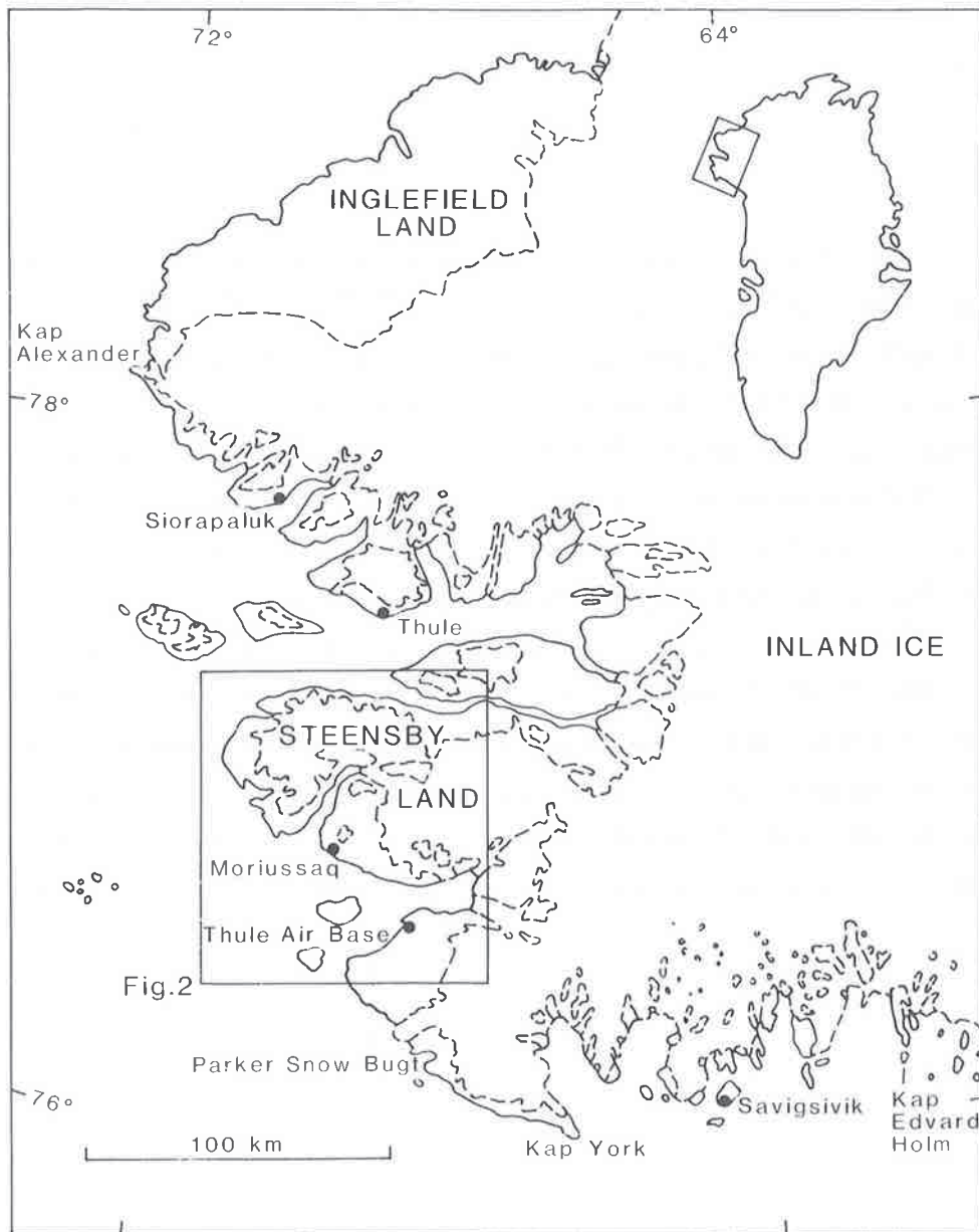
Fig. 1. General location of the Thule black sand province, North-West Greenland, showing the position of the Steensby Land ilmenite showing (inset Fig. 2). Heavy mineral sands have been recorded in the region from Kap Edvard Holm in the south to Kap Alexander in the north.