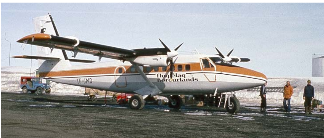
Icelandic Twin Otter aircraft used for aerial photo flights.

An extensive program of low altitude black and white and colour photography was undertaken to supplement the field observations of geological teams. The photographic flights generally followed fjords and valleys, and the photographs were taken from a Twin Otter aircraft flying at low altitudes. The aim was to document geological profiles and sections through as much of the several kilometres thick successions as possible.